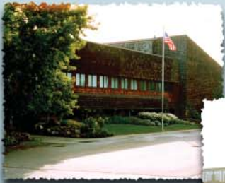
Prior Lake Campus

...to reach unchurched people and empower believers to become fully dedicated followers of Jesus Christ.